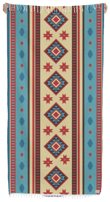
SU3006STH SOUTHERN BREEZE PESHTEMAL