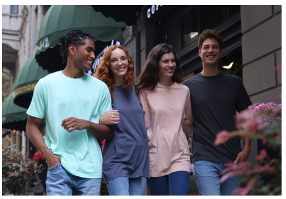
SU7000CVC - HEATHER CVC JERSEY T-SHIRT PREMIUM