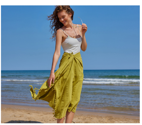
SU3002 - REVERIE PESHTEMAL