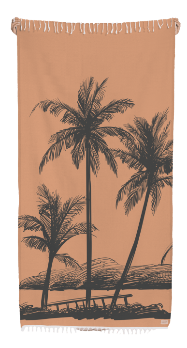
SU3006HVN HAVEN PESHTEMAL