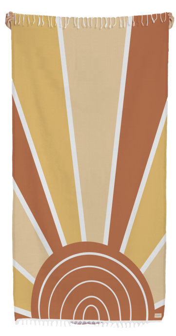
SU3006BRG BRIGHTER DAYS PESHTEMAL