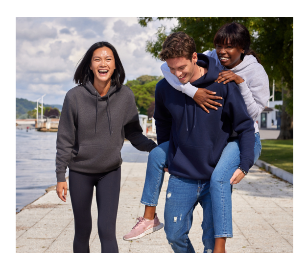
SU7800 - RECYCLED HOODIE - PLANET FRIENDLY