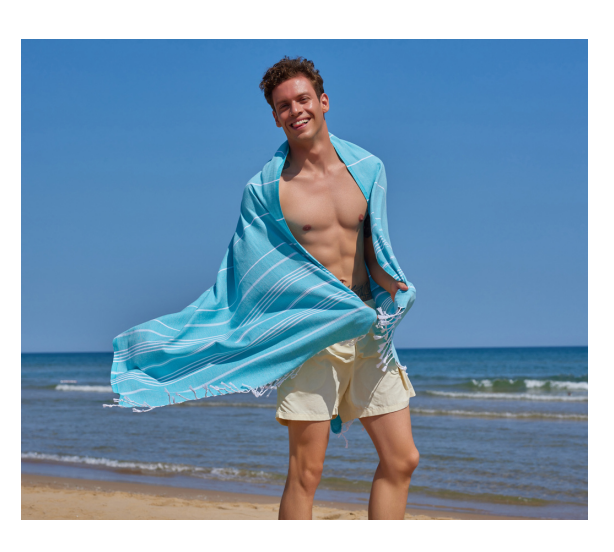
SU3004 - HERITAGE PESHTEMAL