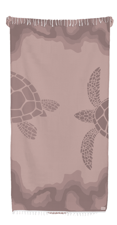
SU3006TRT TURTLE COVE PESHTEMAL