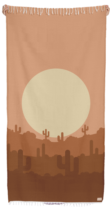
SU3006SUN SUNSET OASIS PESHTEMAL