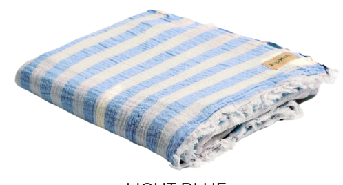
W LIGHT BLUE