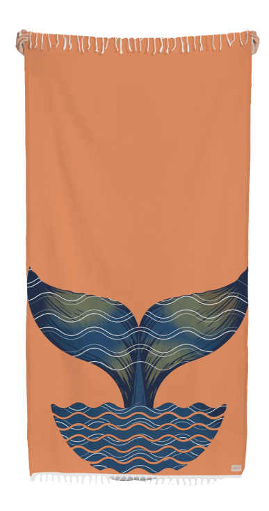
SU3006DVE DIVE IN PESHTEMAL