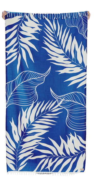
SU3006PRD PARADISE PESHTEMAL