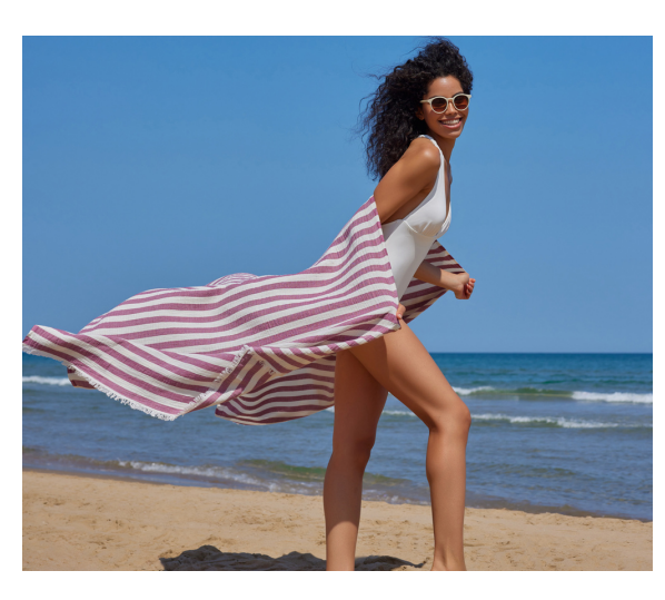
SU3003 - CARNIVAL PESHTEMAL