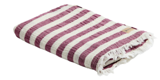
LIGHT PINK BURGUNDY