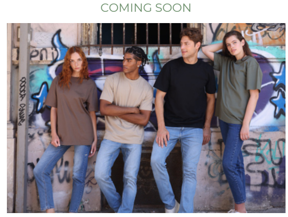
SU7004 - HEAVYWEIGHT T-SHIRT