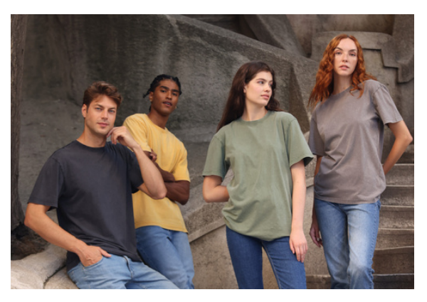
SU7002 - VINTAGE TEE