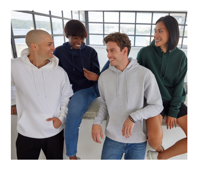
SU7500 - PULLOVER HOODIE PREMIUM