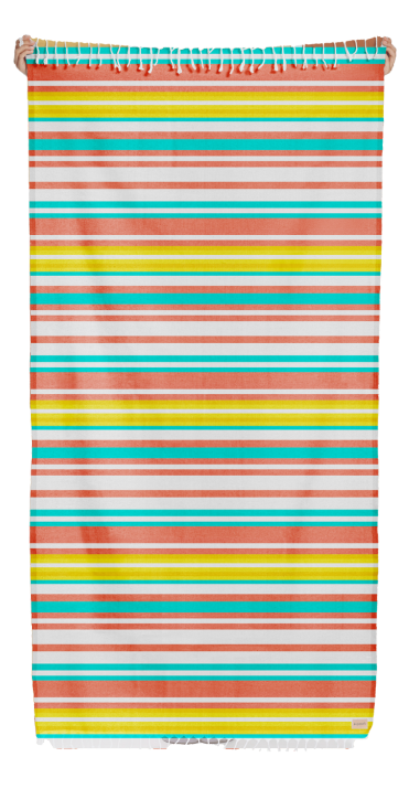
SU3006LNA LINEA PESHTEMAL