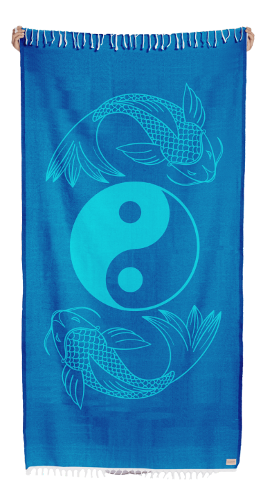
SU3006BLN BALANCE PESHTEMAL