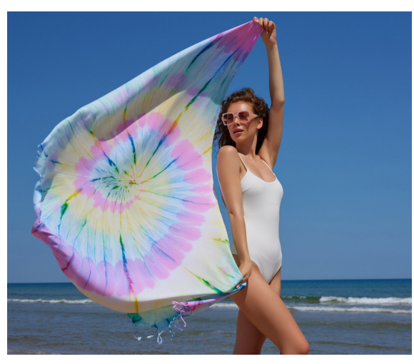
SU3005 - COSMOS PESHTEMAL