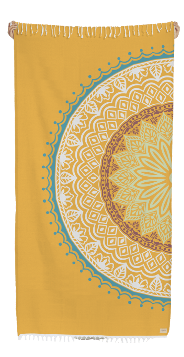
SU3006MND SUNSHINE MANDALA PESHTEMAL