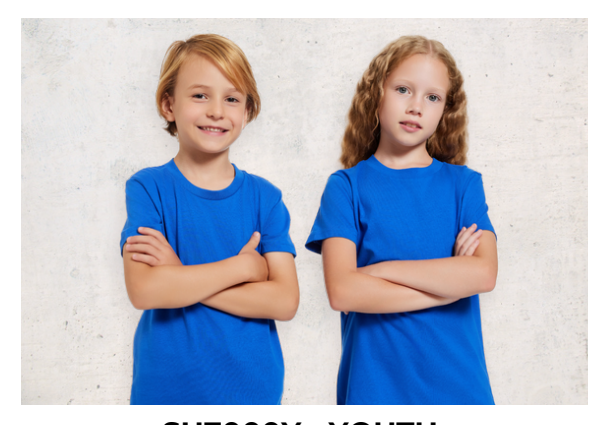
SU7000Y - YOUTH T-SHIRT PREMIUM