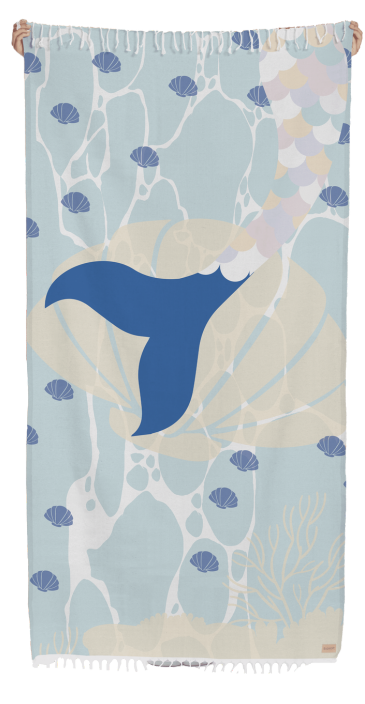
SU3006DRM DREAMAR PESHTEMAL