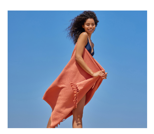
SU3001 - VENUS WAFFLE PESHTEMAL