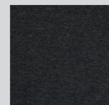
DARK GREY HEATHER